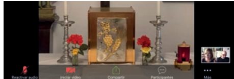
Prayer before the Blessed Sacrament