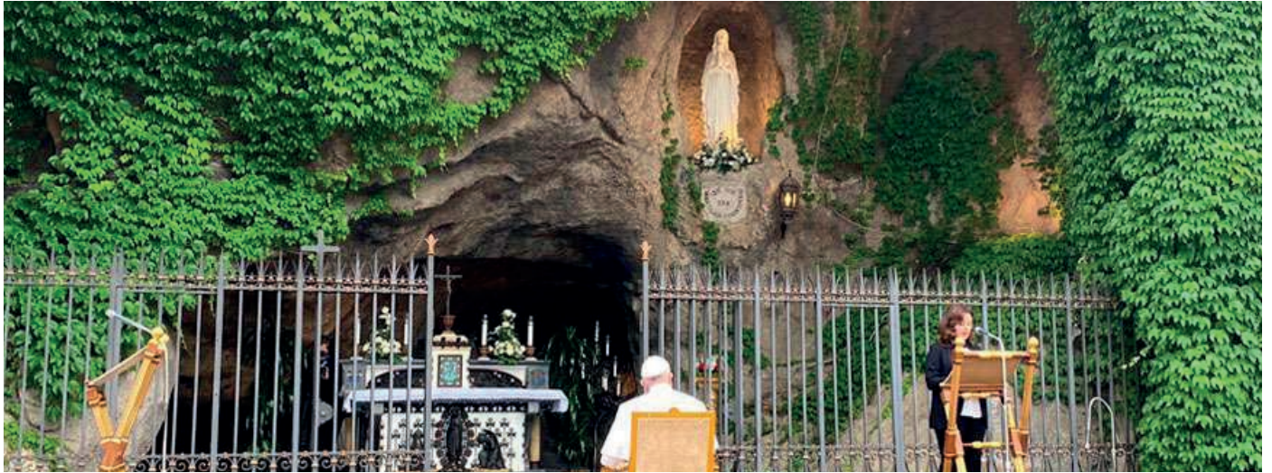
Pope Francis prays the Rosary in the Vatican Gardens.

In a worldwide connection, on Saturday, May 30 at 5:30 p.m., from the Grotto of Lourdes in the Vatican Gardens, Pope Francis presided over the recitation of the Rosary to the Virgin Mary, asking her for help before the Covid-19 pandemic. Likewise, he prayed for the sick, the deceased and their relatives, as well as for all the professionals and volunteers who are fighting against the disease.