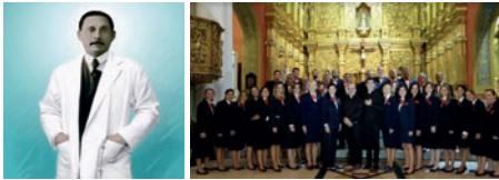
The Betania Choir in La Candelaria Church, place where the remains of Blessed Jose Gregorio Hernandez rest

The Congregation for the Causes of Saints promulgated on June 19, 2020, the decree with the authorization of Pope Francis for the beatification of Venerable Dr. Jose Gregorio Hernandez. The news filled Venezuela with joy. Jose Gregorio Hernandez was a Venezuelan doctor with a deep religious vocation, a Catholic recognized for his solidarity with those most in need.